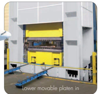
Lower movable platen in